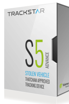
Trackstar S5 Advance

£549 inc. Fitting RRP £168 - 1 Year Subscription £399 - 3 Year Subscription